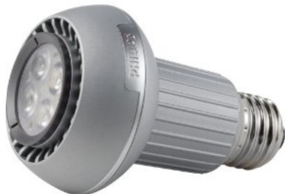
7 Watt R20 Ambient LED Light Bulb